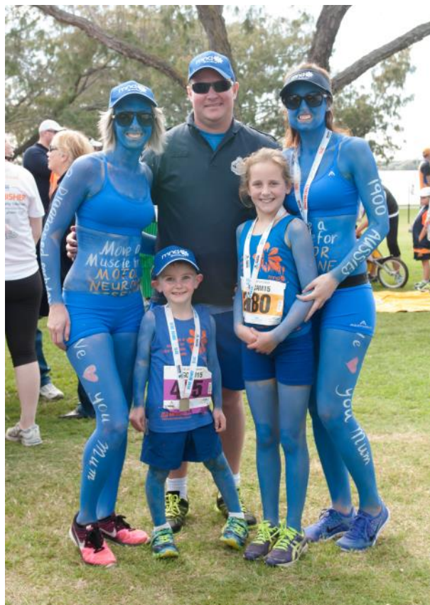
Pictured: The 'Move a Muscle for Motor Neurone Disease' team ran in tribute to their Mum in the 2014 Gold Coast Marathon and raised around $10,000 for MND Queensland.